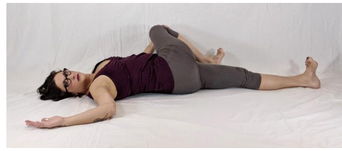
Figure 2: Floor Flow

Repeat the entire sequence of movements with your left leg, alternating sides up to five times each. Be sure to rest for several breaths between each set of flowing movements.