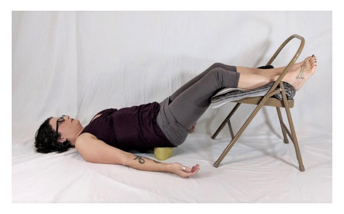
Figure 6: Legs in Chair