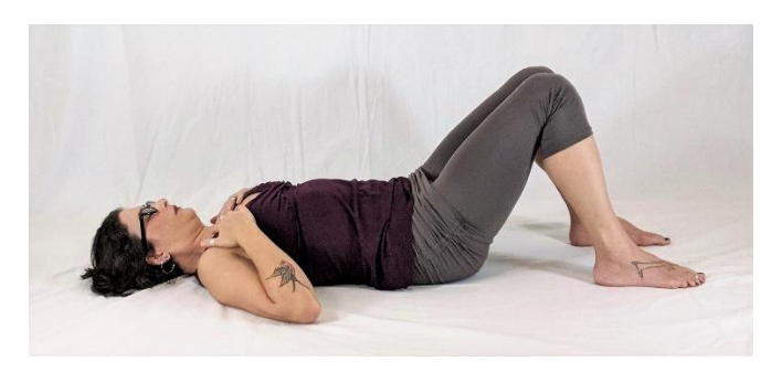
Figure 5: Three-Part Breath

Breathing deeply is part of traditional lymphedema treatment as it increases the movement of the diaphragm and massages the lymph nodes located deep within the abdominal cavity. The full yogic breath, or Three-Part Breath can be practiced while seated in a chair or reclining on the floor or bed. I often imagine the breath like an elevator car moving up and down along an elevator shaft as I practice this pranayama.