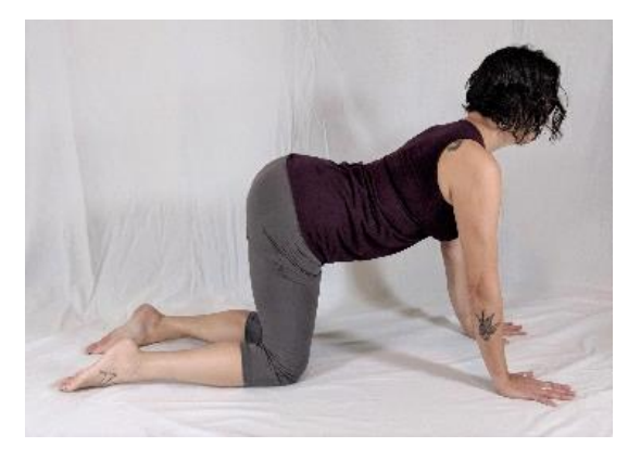
Figure 3: Cat/Cow

This common series of poses is a simple way to move energy and lymph throughout the torso and can be done kneeling on the floor or seated in a chair.