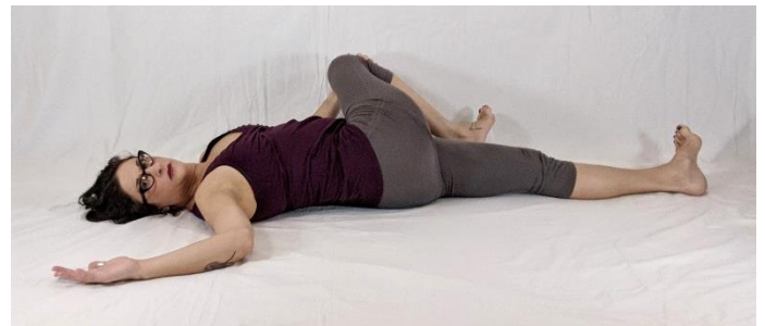
Figure 2: Floor Flow

Repeat the entire sequence of movements with your left leg, alternating sides up to five times each. Be sure to rest for several breaths between each set of flowing movements.