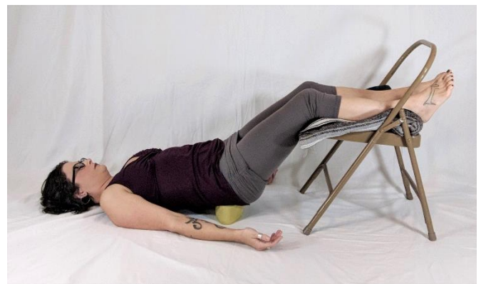
Figure 6: Legs in Chair