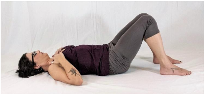
Figure 5: Three-Part Breath

Breathing deeply is part of traditional lymphedema treatment as it increases the movement of the diaphragm and massages the lymph nodes located deep within the abdominal cavity. The full yogic breath, or Three-Part Breath can be practiced while seated in a chair or reclining on the floor or bed. I often imagine the breath like an elevator car moving up and down along an elevator shaft as I practice this pranayama.