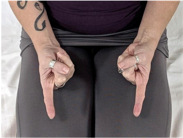
Figure 1: Anushasana Mudra

One of the tools of yoga is practicing mudras which link the physical and energy bodies. Here use Anushasana mudra to activate vyana vayu, the pranic current that moves from the center of the body towards the extremities and supports lymphatic circulation.