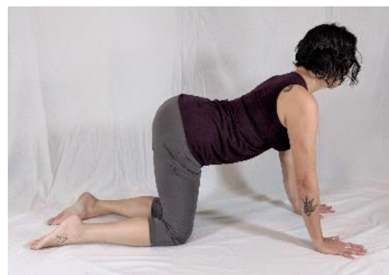
Figure 3: Cat/Cow

This common series of poses is a simple way to move energy and lymph throughout the torso and can be done kneeling on the floor or seated in a chair.